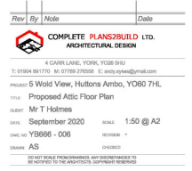
Proposed Attic Floor Plan - 5 Wold View, Huttons Ambo, YO60 7HL